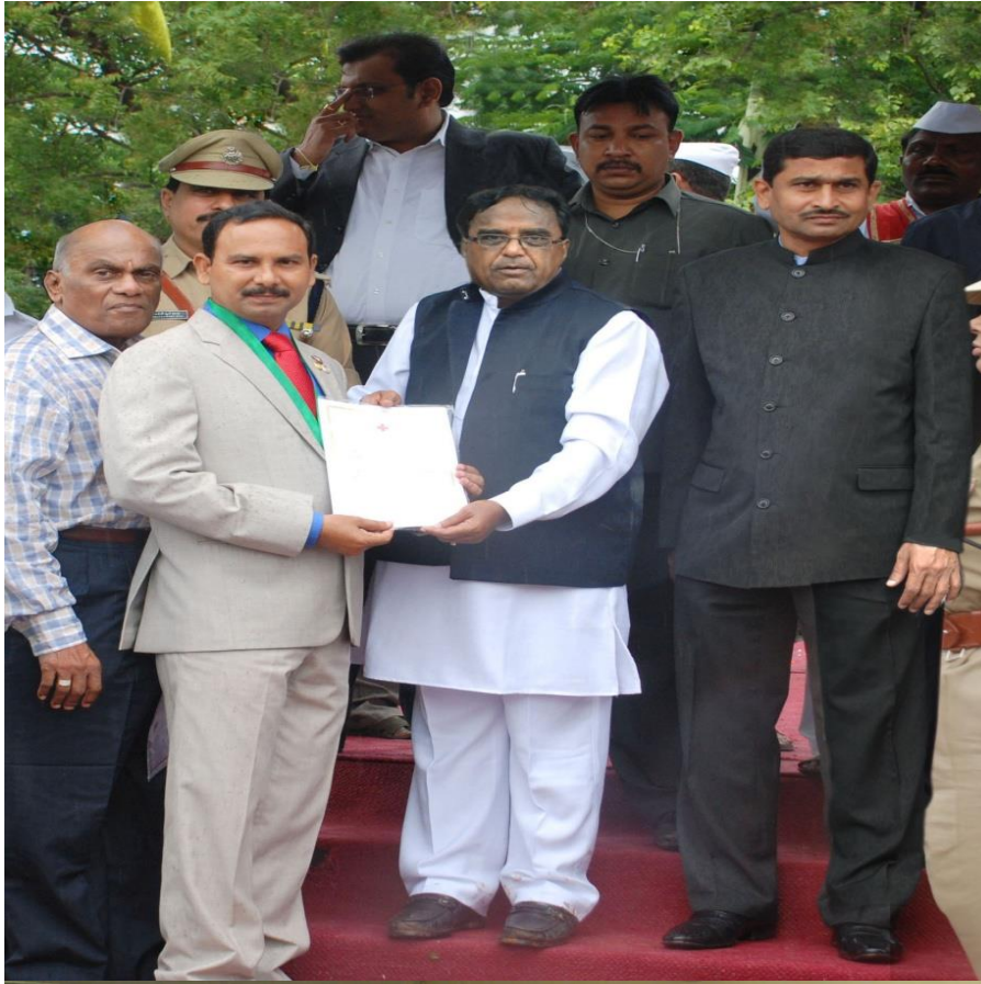
Gold Medal and Merit Certificate-2012-13, from the Governor-AP received from Sri. Ponnala Laxmaiah, IT Minister Govt. of AP