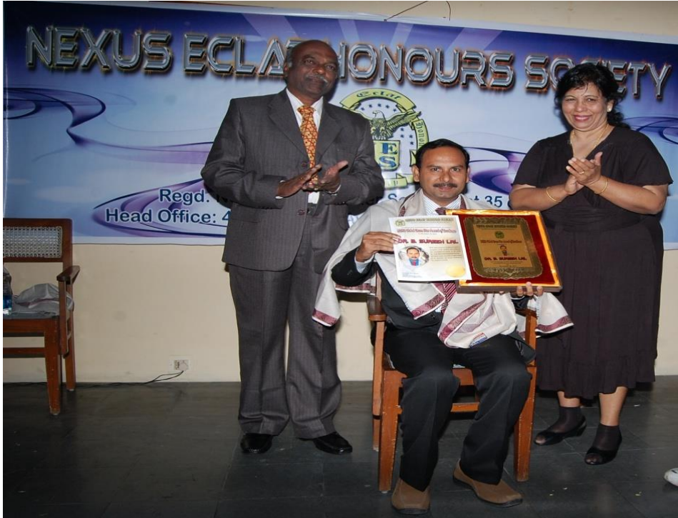
NEHS Global Green Star Award of Excellence-2013, USA