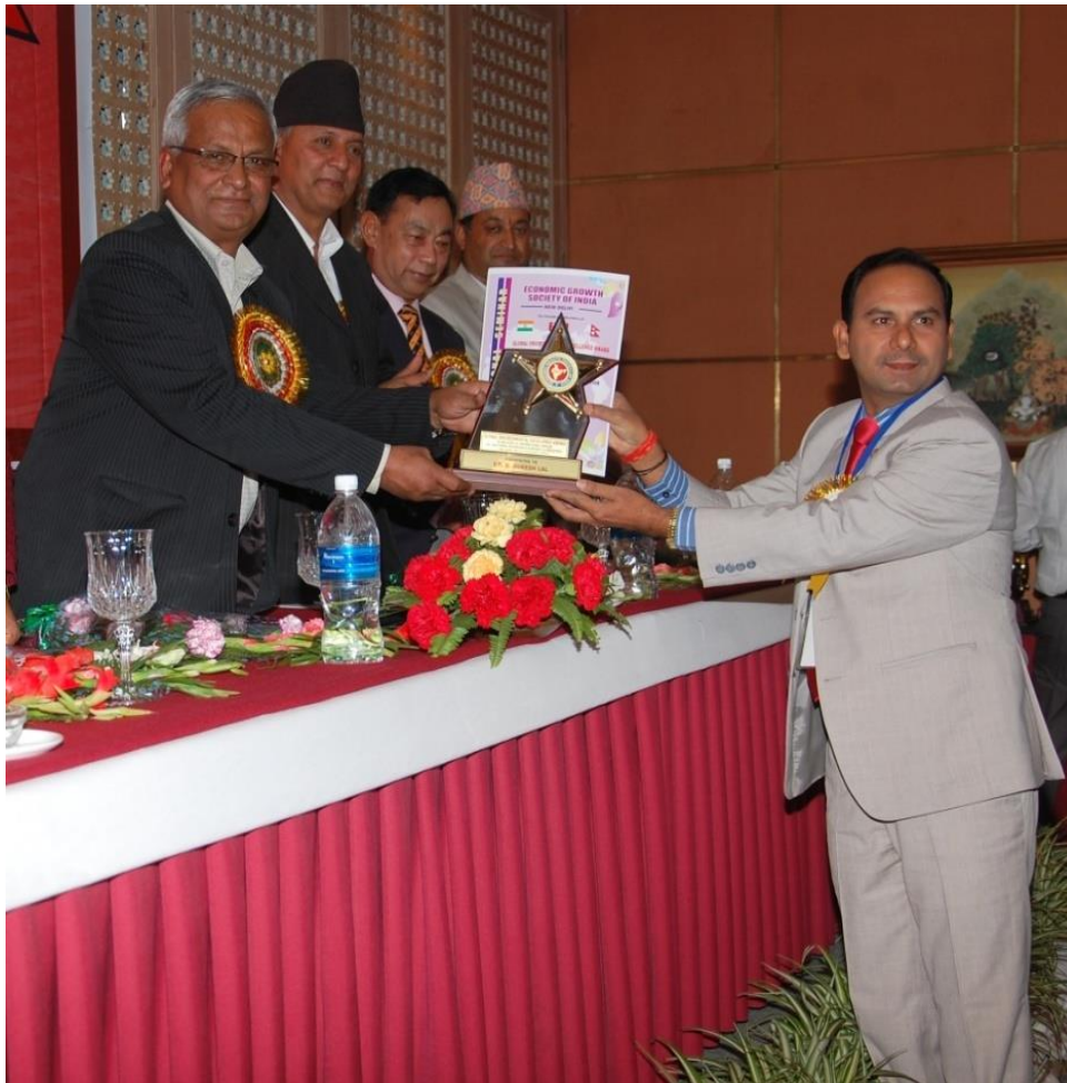
Global Environmental Excellence Award- 2013, Nepal from Sri. Pusp Bahadur Bogah (Minister of Energy, UCP of Nepal)