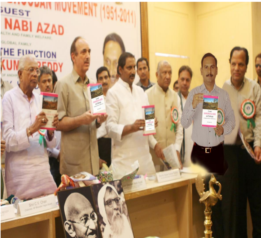
A book on “Current Environmental Issues and Challenges”, released by Shri. Gulam Nabhi Azad, minister for Health and Family Welfare, Govt. of India.