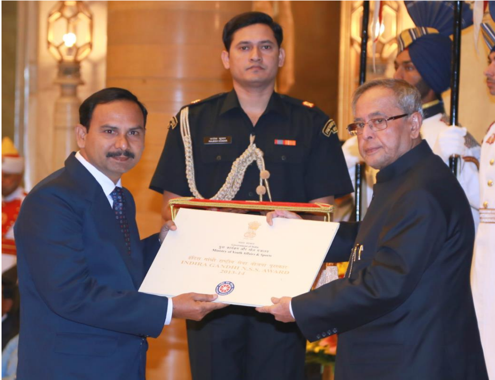
Indira Gandhi NSS Award-2014 by Govt. of India conferred by Sri. Pranab Mukherjee, President of India.