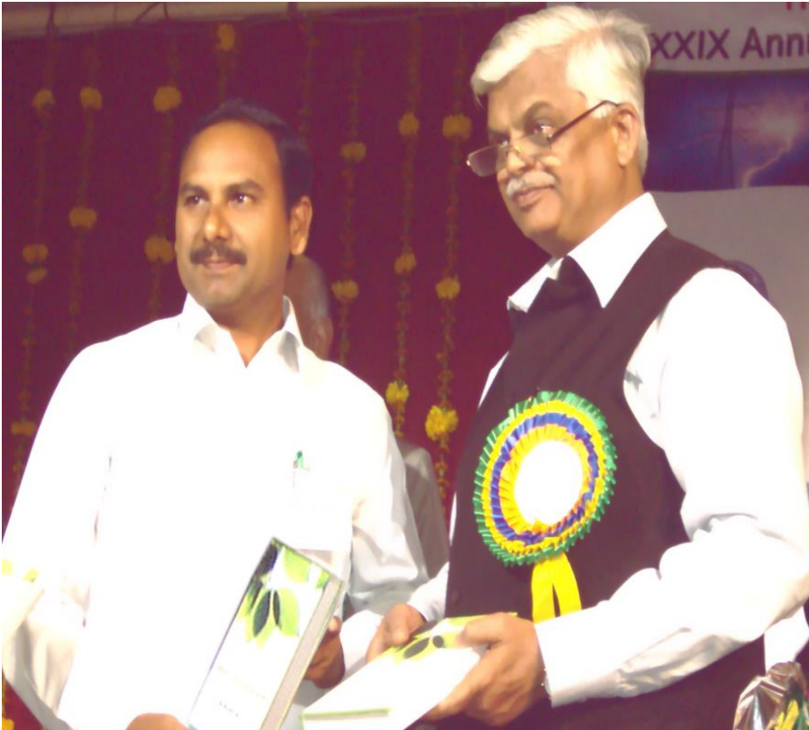
A Book on “Global Environmental Issues: An Empirical Evidences”, released by Dr. Sanjay Baru, Media Advisor to Prime Minister, Dr. Manmohan Singh 2010.